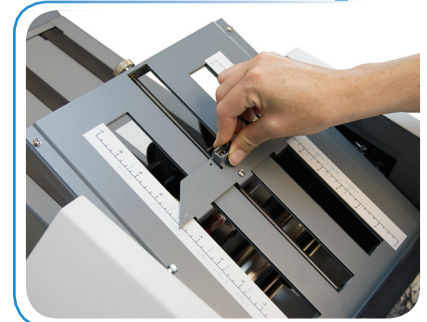
Pre-marked adjustable fold plates