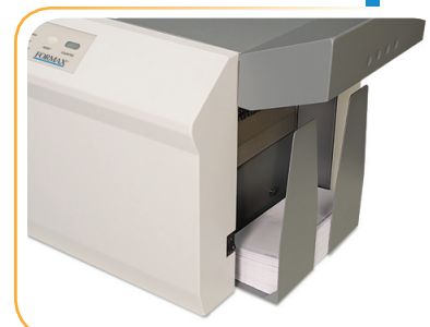
Standard Catch Tray