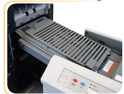
Enclosed paper path provides optimal document security