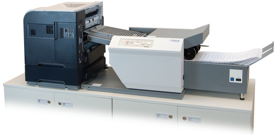
FD 2002IL System shown with IL Pressure Sealer and Alignment Base, laser printer (not included), and optional locking cabinets and 18" conveyor