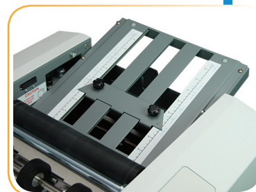
Redesigned fold plates - Clearly marked and easier to adjust