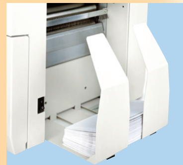
Standard Catch Tray