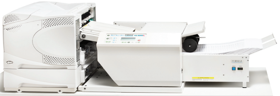
FD 2052IL System shown with IL Pressure Sealer and IL Alignment Base, laser printer (not included), optional conveyor and optional locking cabinets