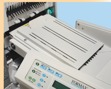
Enclosed paper path provides optimal document security