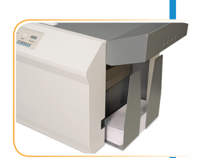
Standard Catch Tray