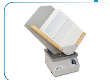
402 Series Jogger - an option which reduces static electricity from forms and aligns them for proper feeding